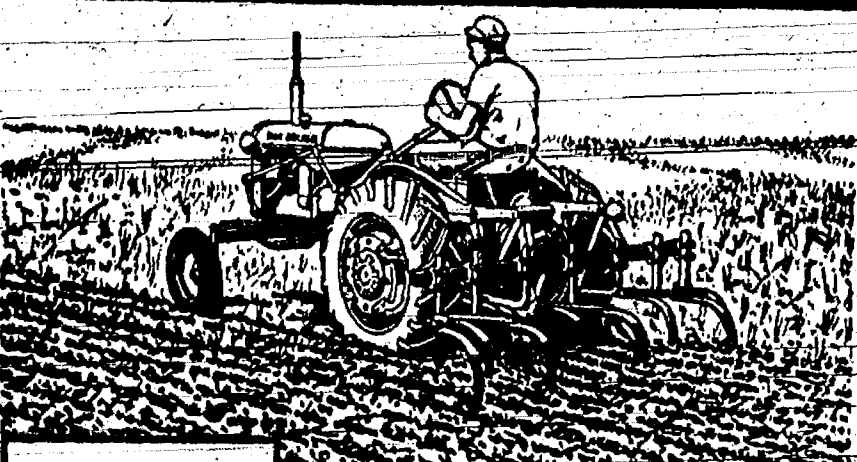
Spring-tooth models for Allis-Chalmers CA (shown) O, B, C and WD. Tectors, 4, 6, 7 and 8-foot widths. Depth gauge wheels available.